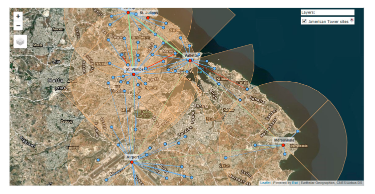
Online network view.

While LINK Planner projections have proven to be extraordinarily accurate, such precision depends on obtaining accurate and complete path data. Based on the path data provided, LINK Planner reports can predict after-deployment performance and provide your installers with the information they need to successfully install the links in your network.